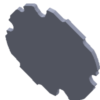
3D View Scale:- 2:1